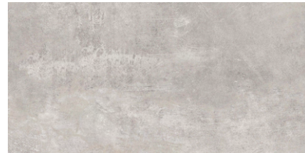
PF00012128 NEW FACTORY GREY 30X60 RETT. FO 134