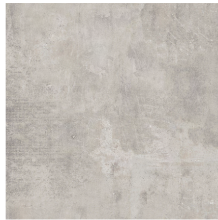
PF00019118 NEW FACTORY GREY 60X60 RETT. FO 135