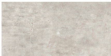
PF00019129 NEW FACTORY TAUPE 30X60 RETT. FO 134