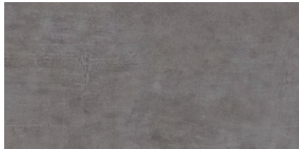
PF00012130 NEW FACTORY ANTRACITE 30X60 RETT. FO 150