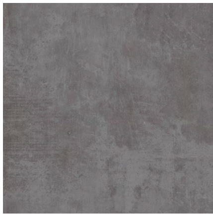
PF00019120 NEW FACTORY ANTRACITE 60X60 RETT. FO 151