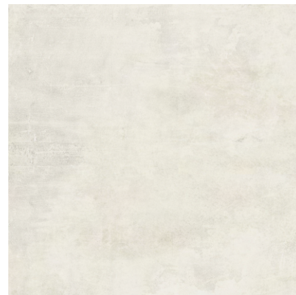
PF00019117 NEW FACTORY WHITE 60X60 RETT. FO 135