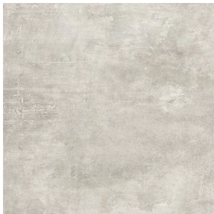
PF00019119 NEW FACTORY TAUPE 60X60 RETT. FO 135